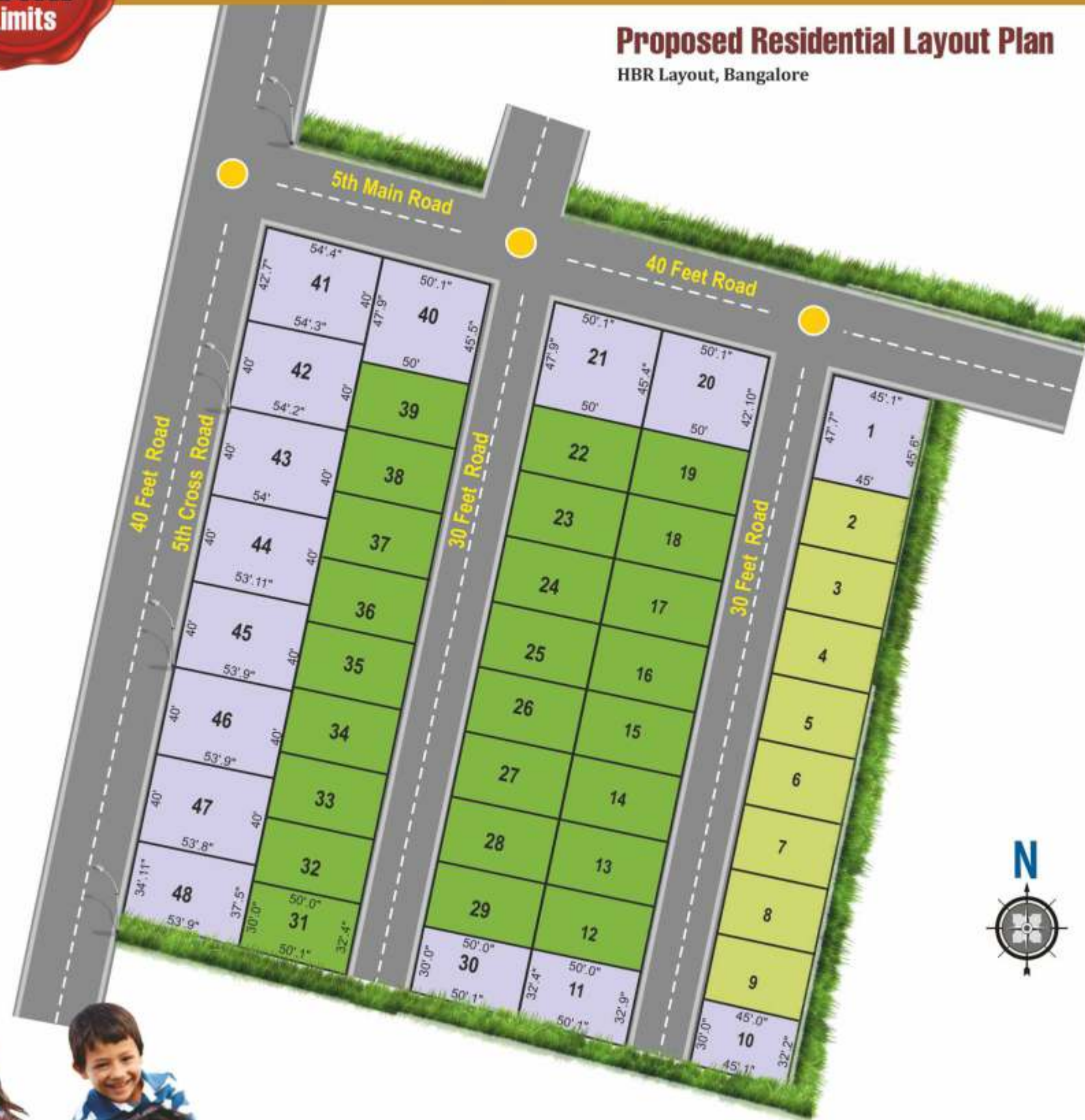
Proposed Residential Layout Plan HBR Layout, Bangalore